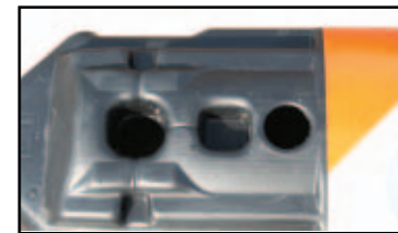
Post Boot for Delineator Post Boot for Fence Post Fill Hole