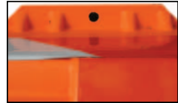
Bottom Flange for Surface Mount

In addition to having a superior reputation in the water ballasted traffic control industry, Yodock® also offers the best quality and most versatility of all airport barricades available.