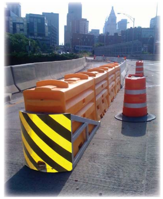
SLED™ TL-3 in Downtown Cincinnati, Ohio