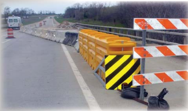
SLED™ TL-3 in use on a Missouri Highway