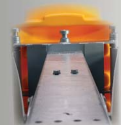
Steel Barrier Attachment