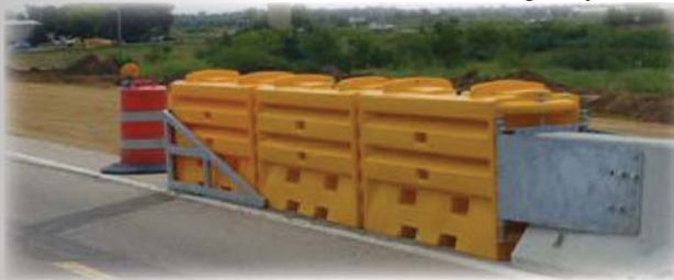
SLED™ TL-2 in Illinois