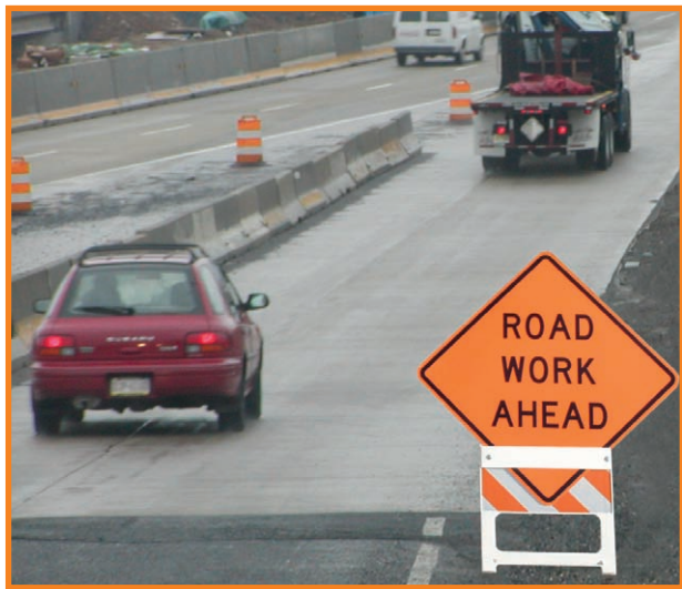
With the addition of a sign sleeve, the Plasticade barricade becomes a sign stand (NCHRP Certified)